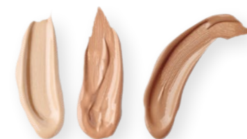
[NUDE] [MEDIUM] [DARK]

En sunn hudpleie krever at du beskytter (PROTECT) huden mot sol og miljøskade, temperatur svingninger, dehydrering og misfarging. BB Kremene er vår løsning for praktisk alt-i-ett hudpleie og hudbeskyttelse. De dekker og behandle kviser, sol og pigmentflekker, redusere urenheter, selv pigmentering og gir beskyttelse for hele spekteret UV stråler. De bidrar til å redusere forekomsten av linjer og rynker og gir dine øyne mer utstråling. Å beskytte huden din er den beste måten å se frisk og ungdommelig ut.